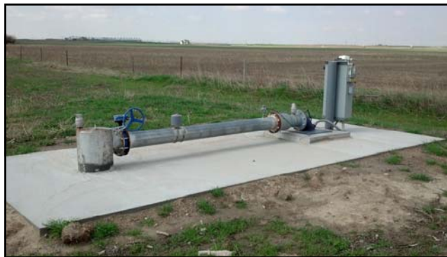
North Dry Creek Augmentation Well

In August 2013, Tri-Basin NRD's directors voted to proceed with plans to form a new Improvement Project Area (IPA), called the Odessa IPA. The project will create a drainage ditch that will divert water to the Platte River, alleviating high groundwater and cropland flooding problems faced by landowners in the area. The ditch will be excavated in the fall of 2014.